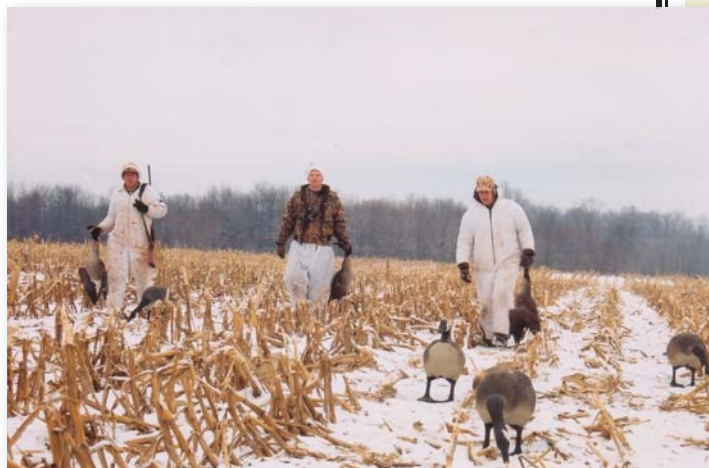
Wisconsin hunting and fishing opportunities and Canadian lodges and outfitters will be just part of the outdoor fun highlighted at shows coming to Wisconsin in the upcoming months.

The 26th Wisconsin Deer & Turkey Expo will be held April 9-11 at the Alliant Energy Center in Madison. Features more than 375 huge antler displays and contest sponsor Miller Lite, measuring by the Wisconsin Buck & Bear Club and How-To Seminars. Also, contests for best outdoor photos and trail cam photos, new product display area, live game animals and predators, flint knapping and mountain men camp, more than 580 booths, 40-plus seminars, and three shooting ranges. For more information call 1-800-324-3337 or connect with