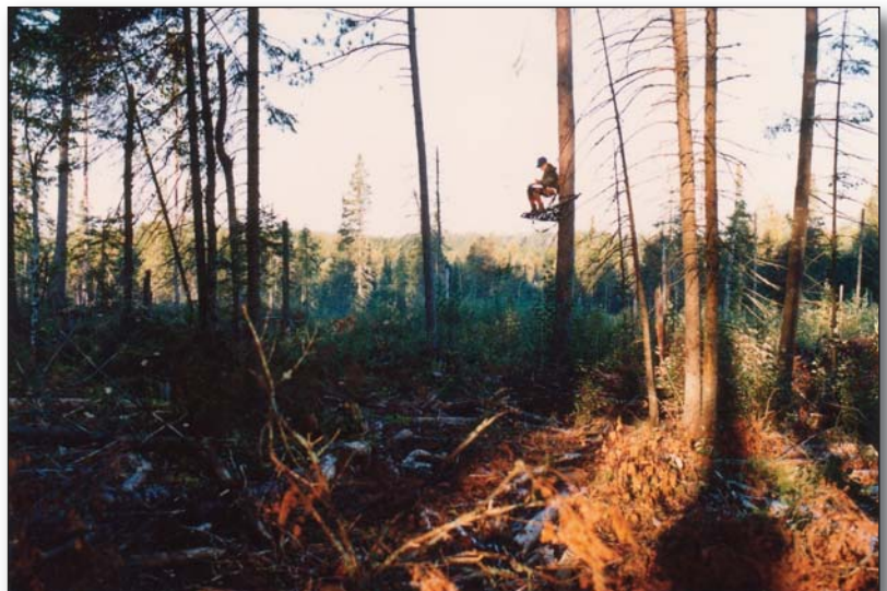
Some letter writers think seeing less deer will make young hunters less interested in pursuing the whitetail.

Also, I stress that in two decades of working with state wildlife and fisheries experts, including many deer managers and conservation wardens in bear dens, trapping wolves, tagging elk at Clam Lake, and on hundreds of other stories on the water and in the field, I have great admiration for the overwhelming majority of those experts. They are people devoted to their jobs. My opinion on deer management is not stated with anger or emotion. I believe that the hunter's opinions are valid. Last