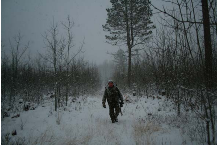
The rut has historically meant great bowhunting in Wisconsin but some northern hunters are reporting a drastic decline in deer numbers. (Dick Ellis)