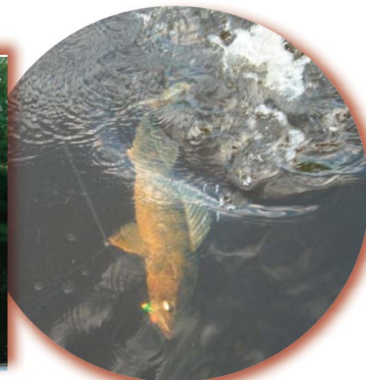
A Peshtigo River walleye receives a rude awakening for taking a jig and a crawler; an introduction to the boys in the boat.

the lakes are still frozen and in the spring these tributaries of Green Bay are just awesome. But it's a great game now too. The Peshtigo is like rivers everywhere. The Cumberland in Tennessee, the Brule, the Mississippi, the Menominee. If we were on the Wisconsin I'd be fishing it the same way because they have the same tendencies; runs and rapids and eddies that lead to deeper holes and pools and it starts all over again. Structure is anything that provides the fish sanctuary; boulders, down trees, timber, that's what's going to be giving us fish. You don't need a fish finder. You just learn to read the water."