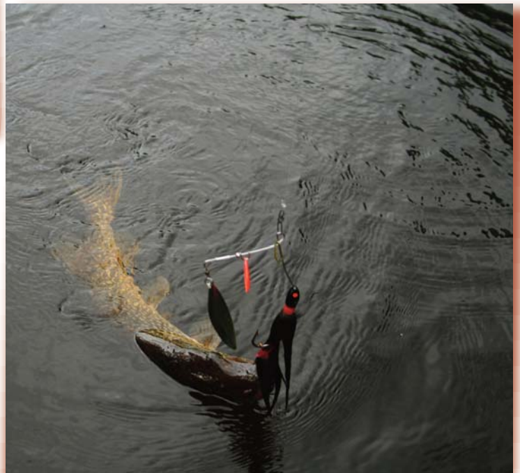
A northern Pike surrenders to a tandem spinner bait during a float trip targeting multi-species on the Peshtigo River last week in Marinette County. The pike was released.