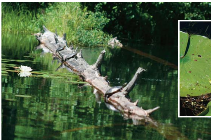
LEFT: A scenic journey, good fishing, isolation, and ample encounters with wildlife including bald eagles and these turtles sunning themselves on a log on the Trout River mark a canoe trip last week within the Northern Highland-American Legion State Forest. CENTER: Thousands of water lilies in full bloom add to the scenic canoe/fishing trip on the Trout River last week within the Northern Highland-American Legion State Forest.