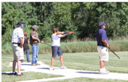
Hartford Conservation and Gun Club (262) 673-9919

Check out the Women for MACC website www.womenformacc.org for more information or the Gun Club website at www.shooterspost.com