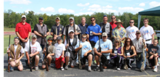
2011 Hartford Shoot For A Cure Celebrity Team